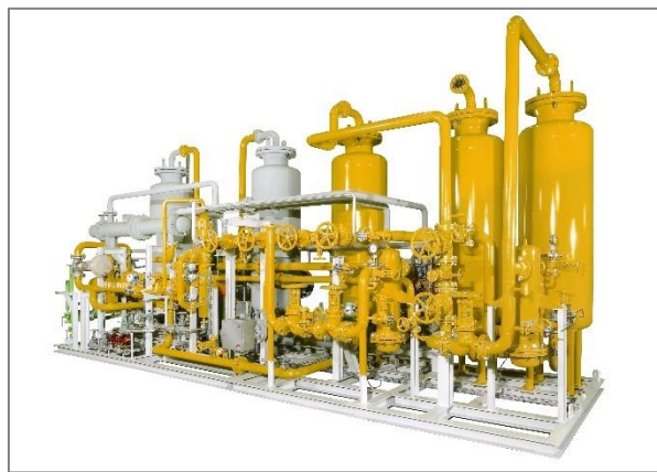
Hydrogen Purification 10.000 Nm 3 /h