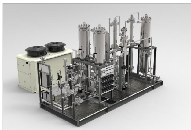
Hydrogen purification – power to gas