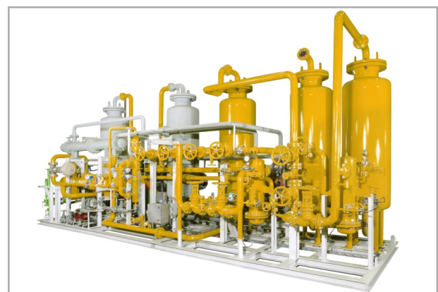
Hydrogen Purification 10.000 Nm 3 /h - Bayer AG